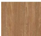
Oak w/transparent lacquer *) MO 107 series is also available oiled, white oiled or soap- treated surface

Wood - see possible executions under each model