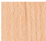
Beech w/transparent lacquer