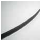
Compact laminate white, with black crescent edge.

all images here plus many more are available at www.naughtone.com alternatively, get in touch to request our dropbox link to our full library.