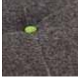
Contrast button and/or stitching.