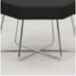
Chromed finish base.

POL-TAB Pollen table metric (mm) W685 D500 H350 imperial (in) W27 D23.5 H14