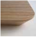
Oak veneer, with reverse chamfer, polished MDF edge