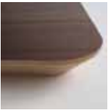
Walnut veneer, with reverse chamfer, polished MDF edge