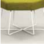
Black, White or RAL colour base.