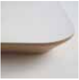
White MFMDf, with reverse chamfer, polished MDF edge