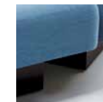
Plinth fascia in Black or White.