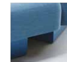
Plinth fascia in RAL colour.