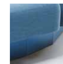
Plinth infill panel.