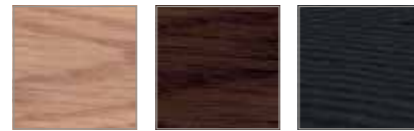
Natural Walnut Black