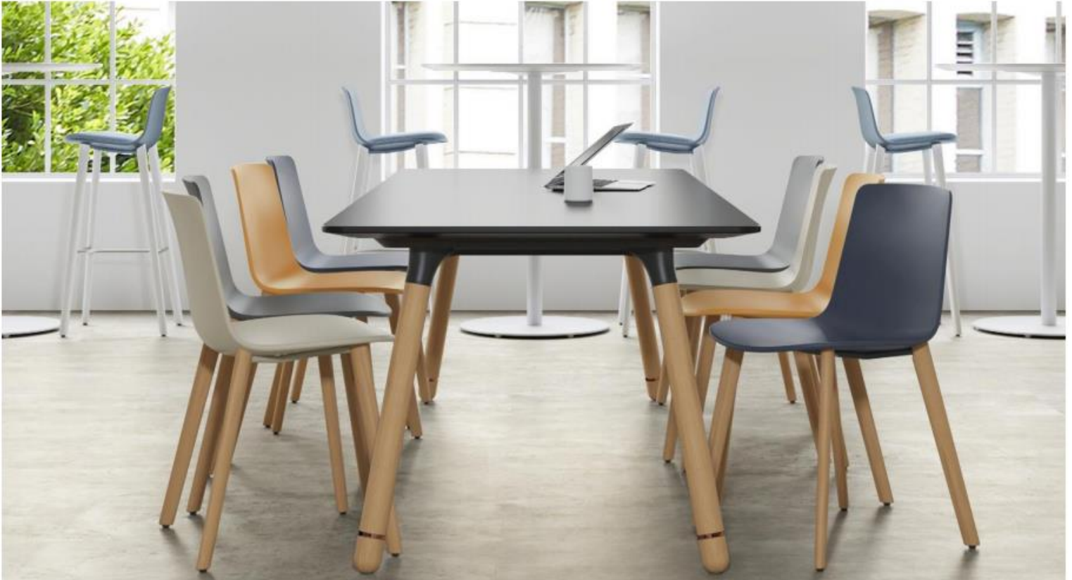
Product pictured is not the exact style of the product studied in this document.