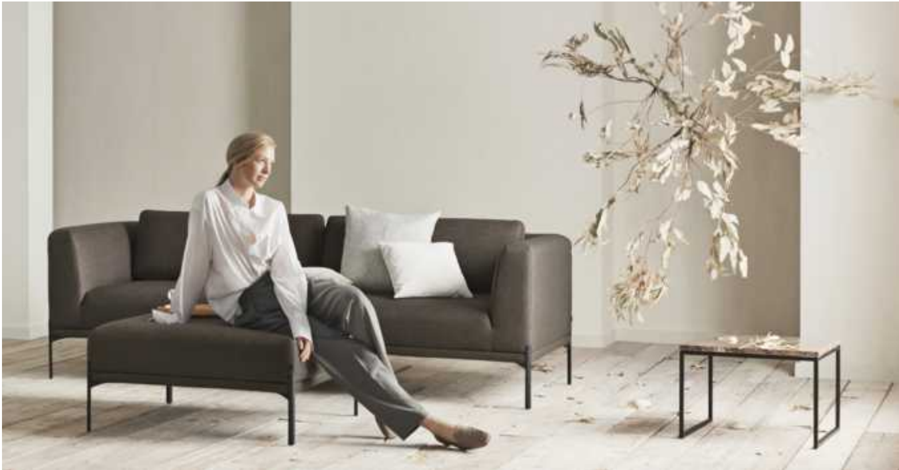
Caixa Modular Sofa & Pouf in London, Brown. Designed by BÖTTCHER & KAYSER. Como Coffee Table. Designed by Glismand & Rüdiger.