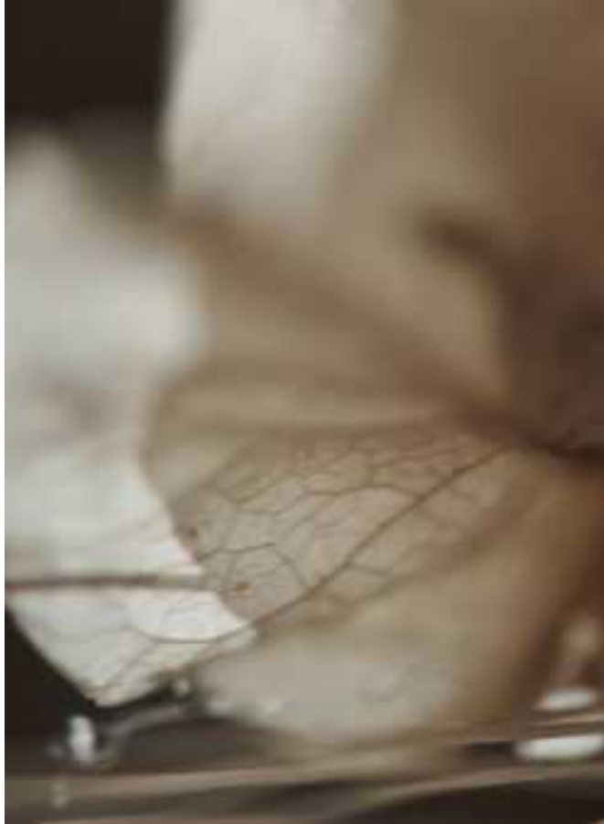
Apelle Chair. Designed by Busetti Garuti Redaelli.