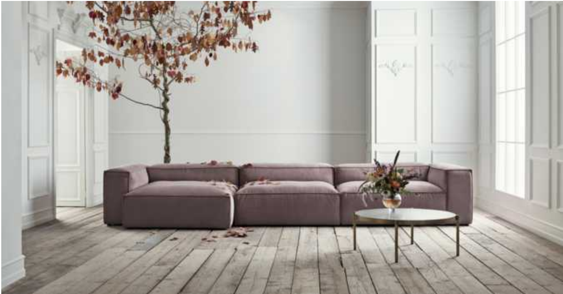
Cosima Modular Sofa in Linca, Rosa*. Designed by kaschkasch.

*The fabric is not a part of the Steelcase Collection.