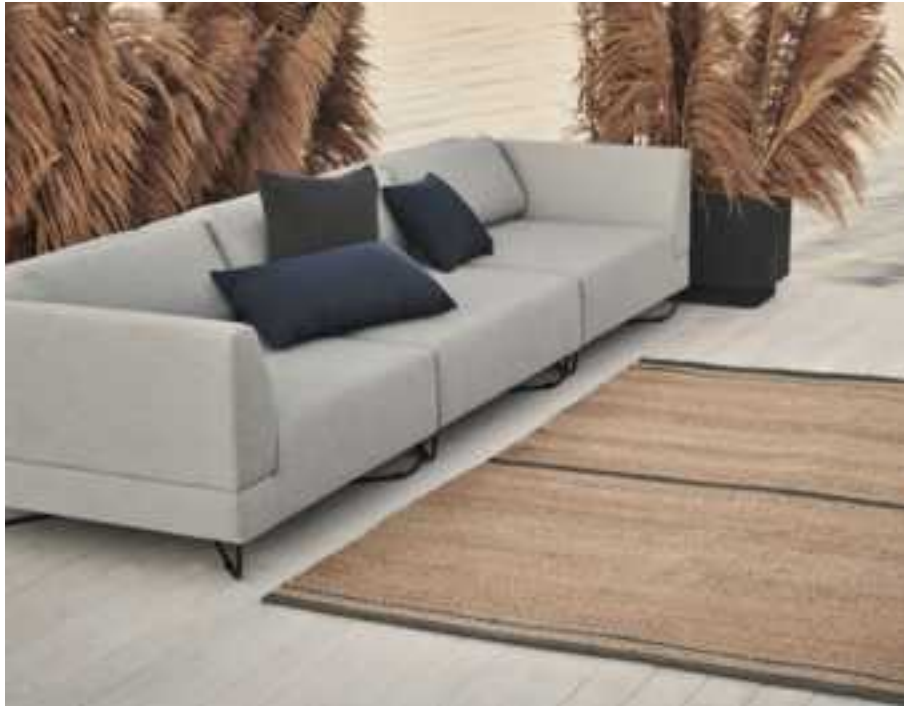
Orlando Outdoor Modular Sofa in Leaf, Light Grey. Designed by Glismand & Rüdiger.