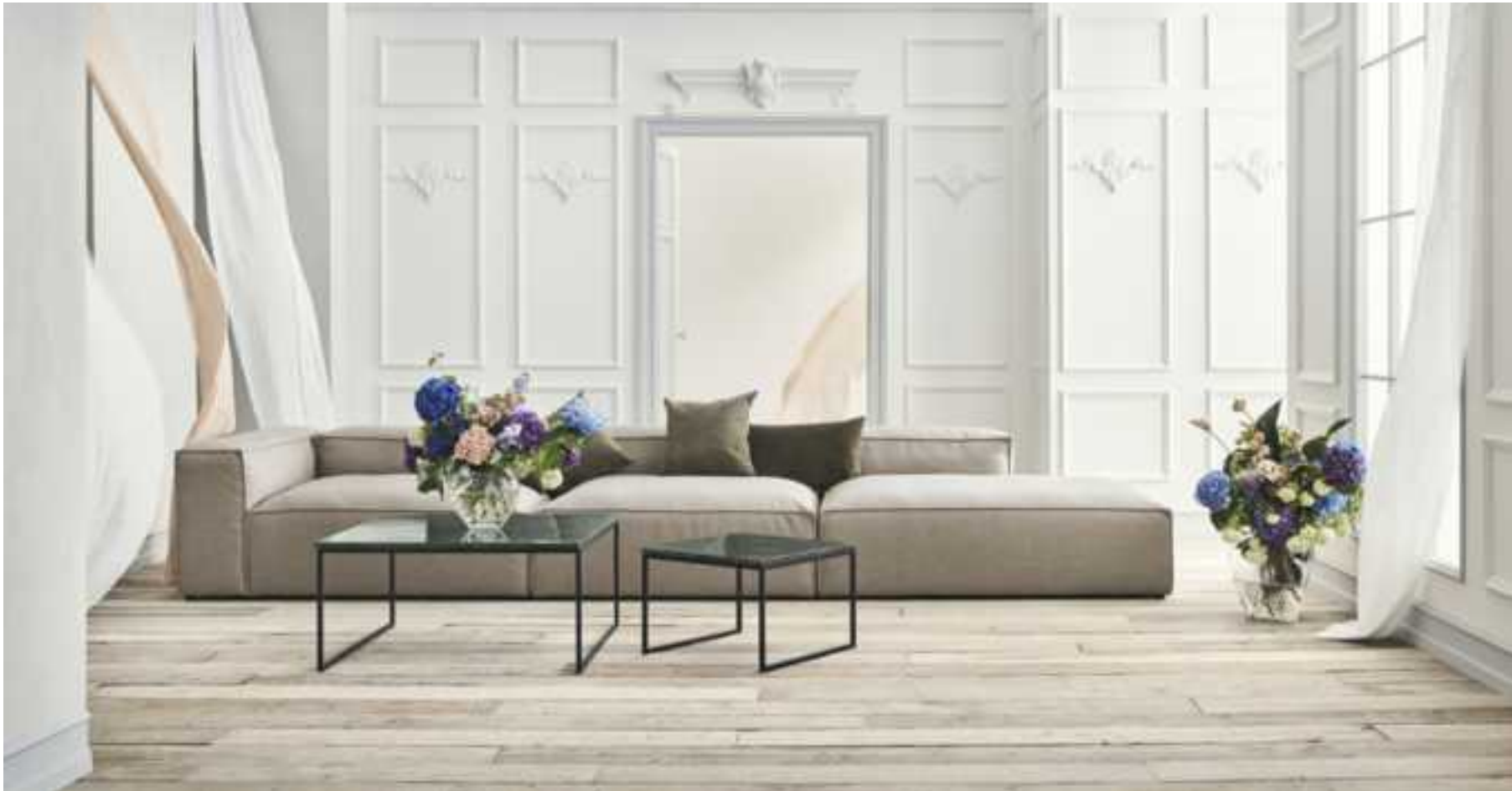
Cosima Modular Sofa in London, Grey Brown. Designed by kaschkasch. Como Coffee Table. Designed by Glismand & Rüdiger.