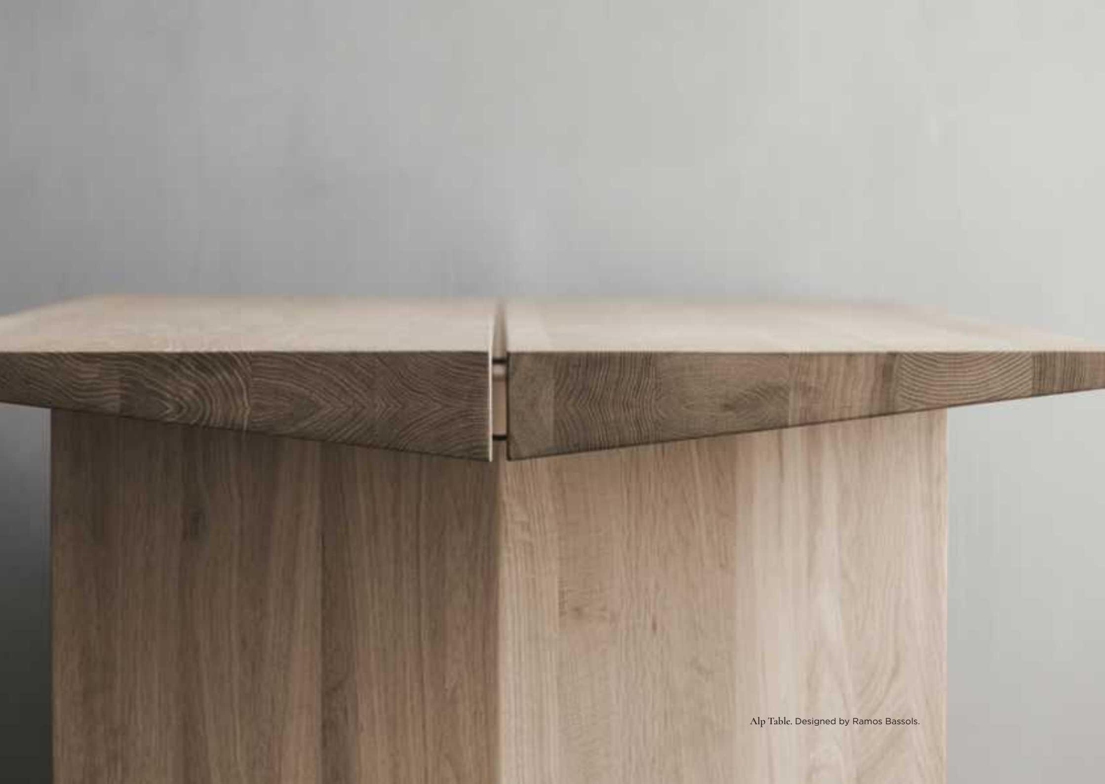
Alp Table. Designed by Ramos Bassols.