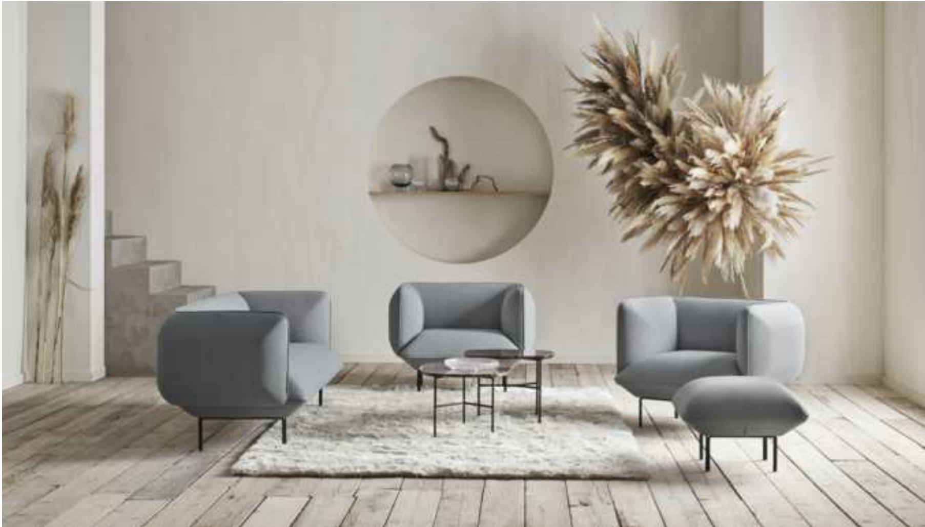
Cloud Sofa, Armchair & Pouf in Baize, Grey. Designed by Yonoh Creative Studio. Pod Coffee Table. Designed by Busetti Garuti Redaelli.