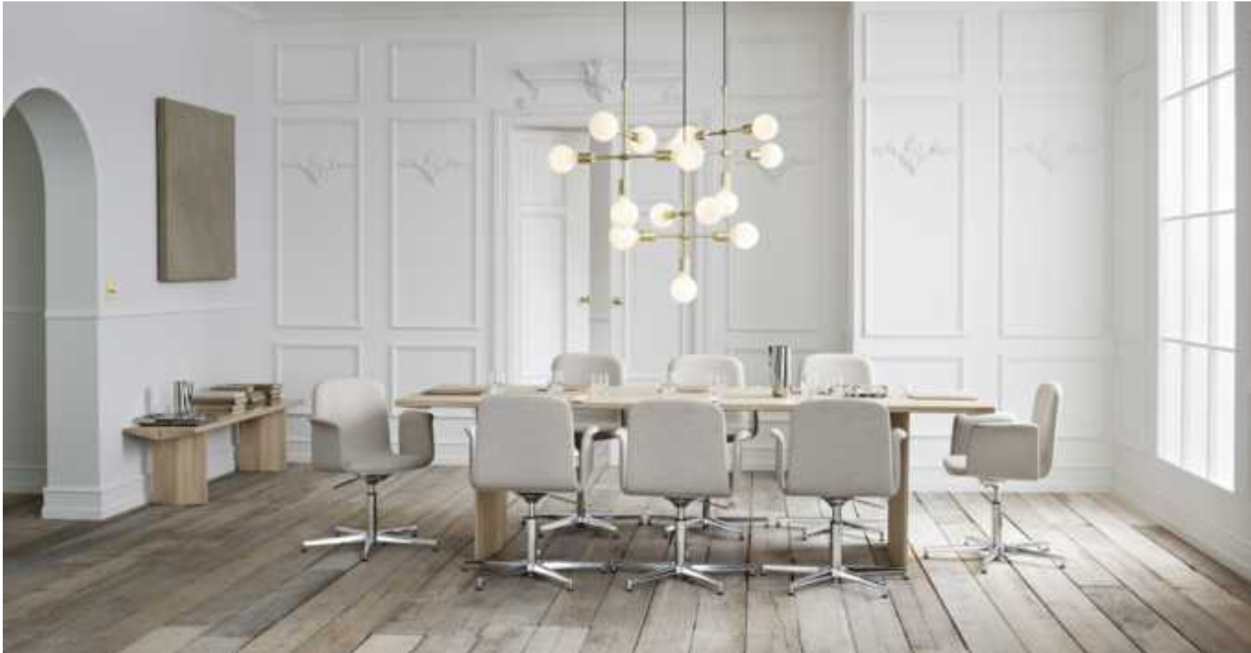
Palm Center Base Chair with Armrest in Baize, Sand. Designed by Says Who.