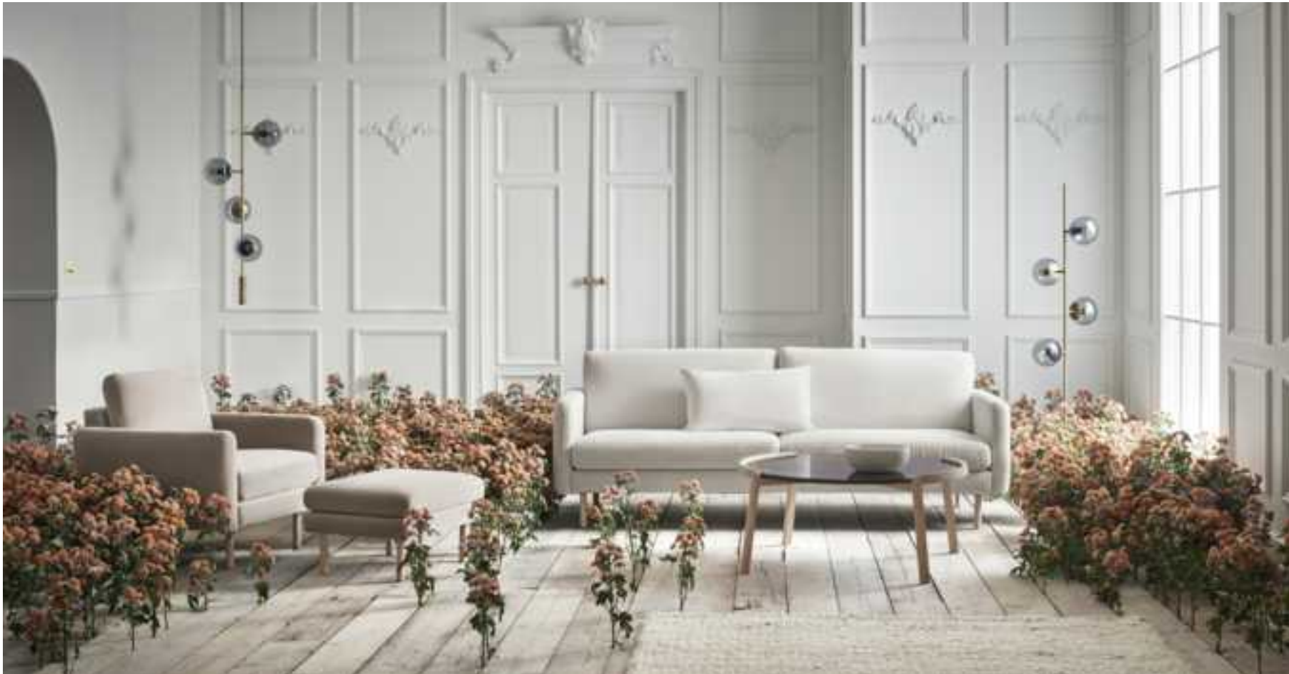
Scandinavia Remix Sofa in Linea, Beige*. Designed by Glismand & Rüdiger. Scandinavia Armchair & Footstool in Ritz, Beige. Designed by Glismand & Rüdiger. Mix Coffee Table. Designed by Studio Gud. Orb Lamp Series. Designed by 365° North.

*The fabric is not a part of the Steelcase Collection.