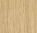
NATURAL OAK FINISHING STANDARD

ROOM 26 / CAMPING / AIRBENCH / PENTAGON PRIMARY POUF 04 / M2 TABLE